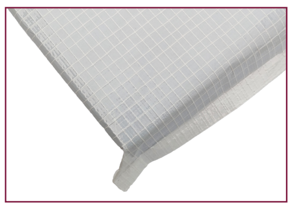
The VEC-CAP-A and CAP-B have a white, reinforced mylar exterior that is easily wipeable and tearresistant, ideal for clean room applications.

VEC Cleanroom Acoustic Absorption Panel (VEC-CAP-A) is a wall-mounted panel that absorbs ambient cleanroom noise, dramatically reducing noise refraction and overall noise levels.