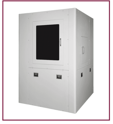
Daeil DSE Series Acoustic Enclosure

Acoustic enclosures allow customers to isolate only the instrument in applications with very high noise levels or when treating the room and noise source is impractical. VEC offers the Daeil DSE Series Acoustic Enclosure which provides best-in-class sound performance for your SEM or Dual Beam microscope. With 18 dB of noise reduction at 80 Hz, 20 dB at 100 Hz, and 40 dB at 200 Hz, the Daeil DSE will bring most locations within the microscope's acoustic specification. In addition, the enclosure has a cooling control system to prevent rising temperatures, and users can add custom configurations and accessories according to requirements.